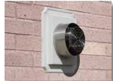
Compact, Aesthetic Concentric Vent/Combustion Air Horizontal Vent Kit