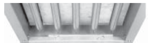
FIGURE 2 - Location of burner rack support as it was factory-installed on the inside front of the heater

(NOTE: Support was removed when the heater was dis-assembled; screws should be loosened but still in place.)