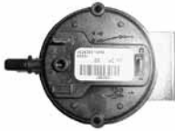
Figure 1 Pressure Switch

WARNING: The instructions in this sheet are designed to prepare a heater for high altitude operation prior to installation. If your heater is installed, for your safety, turn off the gas and electric before servicing.