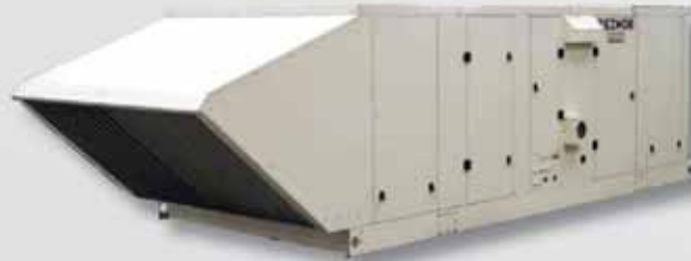
Split HVAC System