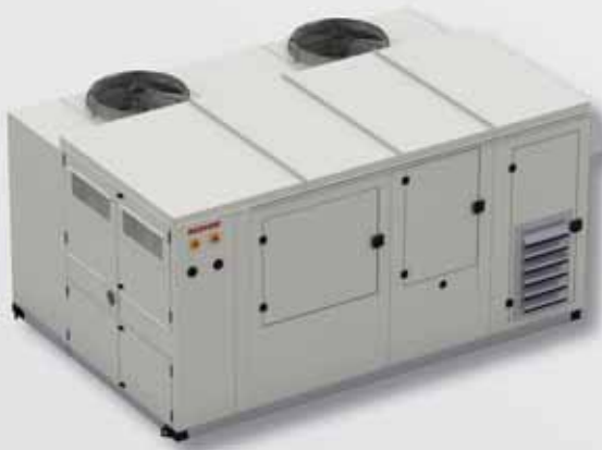
Packaged HVAC System