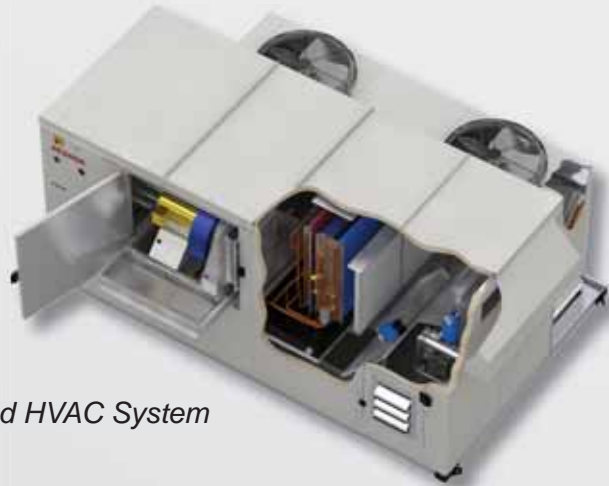
Packaged HVAC System