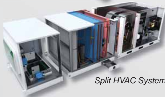
Split HVAC System

Superior Dehumidification with ReHeat Pump ™